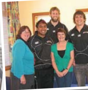
The boys from North Harbour Rugby were a great hit at Harbour School.