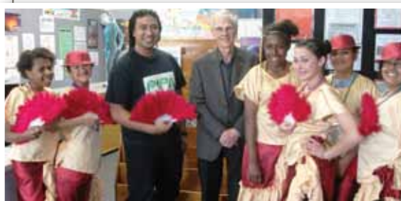
Actor Troy Tu'ua was no featherweight when he spread the reading message at Tamaki Intermediate. Some of you might recognise Troy from last year's Duffy Theatre show. School Sponsor: Rotary Club of Remuera