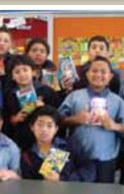
an was joined over at St Paul's Sponsor: Mainfreight land

Extreme 3-D: Wild Weather was the most popular book in the 16 year history of Duffy Books in Homes book offers. 18,462 Duffy kids around New Zealand received this great book in the last book offer!