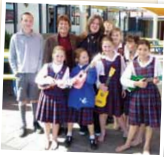
Kiwi music legend Shona Laing may have met her musical match at St Joseph's School in Paeroa! Sponsor needed

93,036 Duffy kids around the country each received two free books donated by their schools and sponsors in the last three weeks of Term Three.